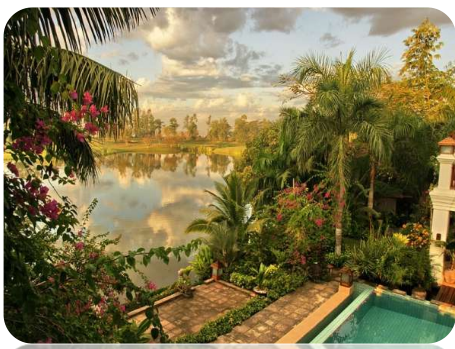
Pun Hlaing Golf Estate (PHGE)