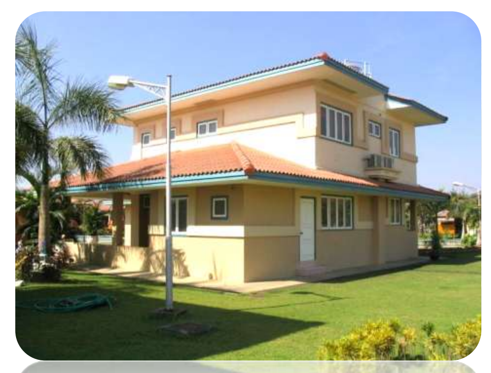
FMI City - Orchid Garden