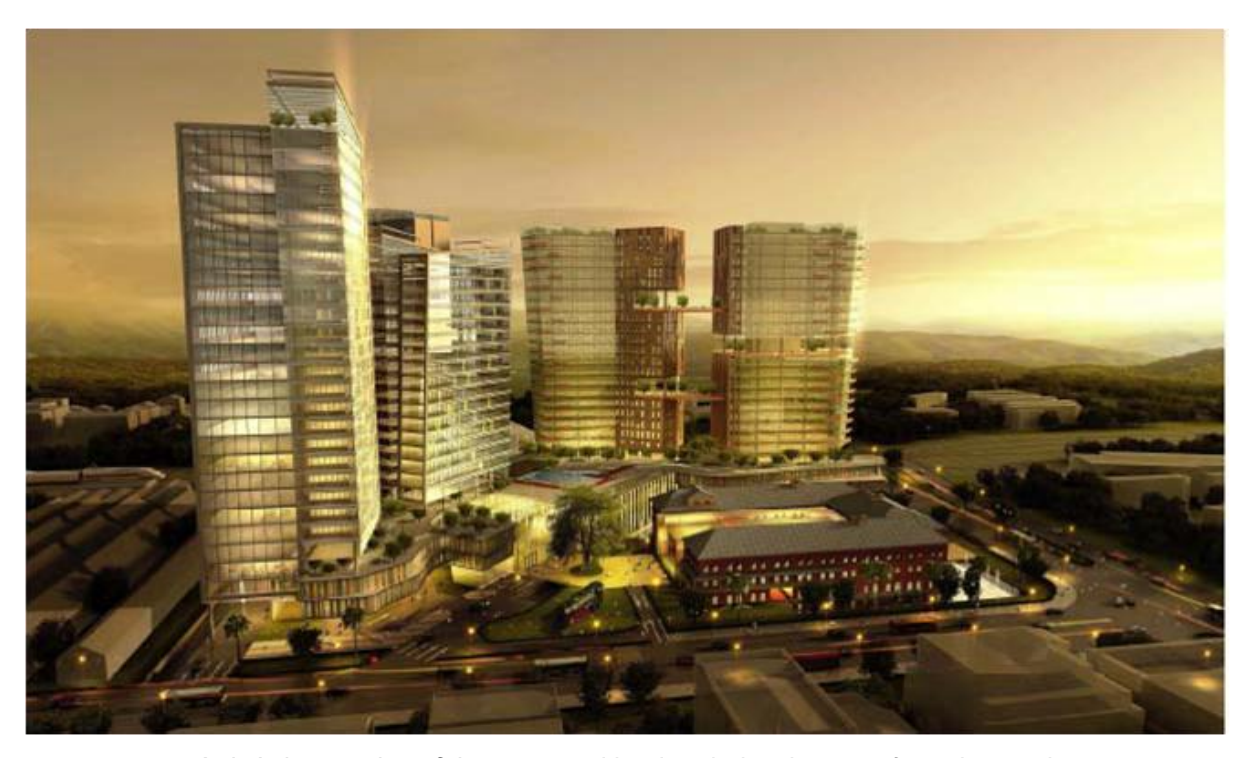
Artist's impression of the proposed landmark development from the south

The proposed landmark development will be an iconic 2 million square feet GFA (Gross Floor Area) mixed-use development of residential, retail, hospitality and commercial property on approximately 10 acres of land located in the middle of the downtown Yangon business district. The site is situated between Trader's Hotel, the Sakura Tower and the famous tourist destination of Bogyoke Aung San Market. The site currently hosts the FMI Centre Tower, the Grand Mee Ya Hta Hotel and one of Yangon's most famous heritage buildings, the former Railway Headquarters built in 1877.